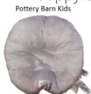
Pottery Barn Kids