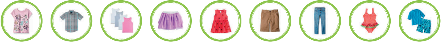
Spring/Summer short sleeves, tank tops, skirts, dresses, shorts, jeans, leggings, capris, button-up cotton cardigans, athletic pants, swimsuits, and swim shirts.

Think Sunshine! Lightweight fabrics (like cotton), in light colors. Unlined clothing.