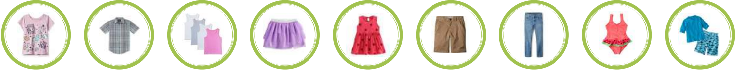
Spring/Summer short sleeves, tank tops, skirts, dresses, shorts, jeans, leggings, capris, button-up cotton cardigans, athletic pants, swimsuits, and swim shirts.

Think Sunshine! Lightweight fabrics (like cotton), in light colors. Unlined clothing.